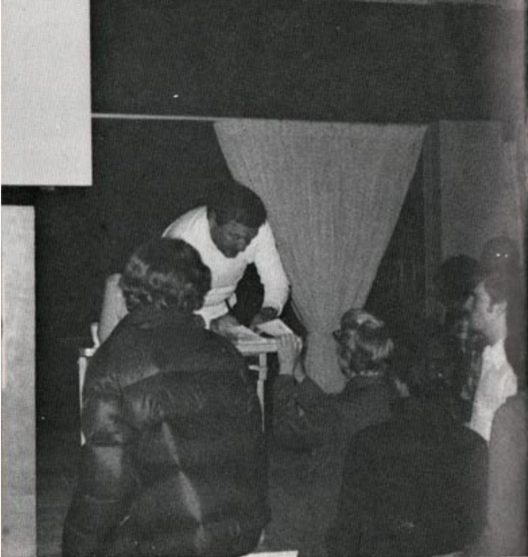
Autograph seekers crowd the podium