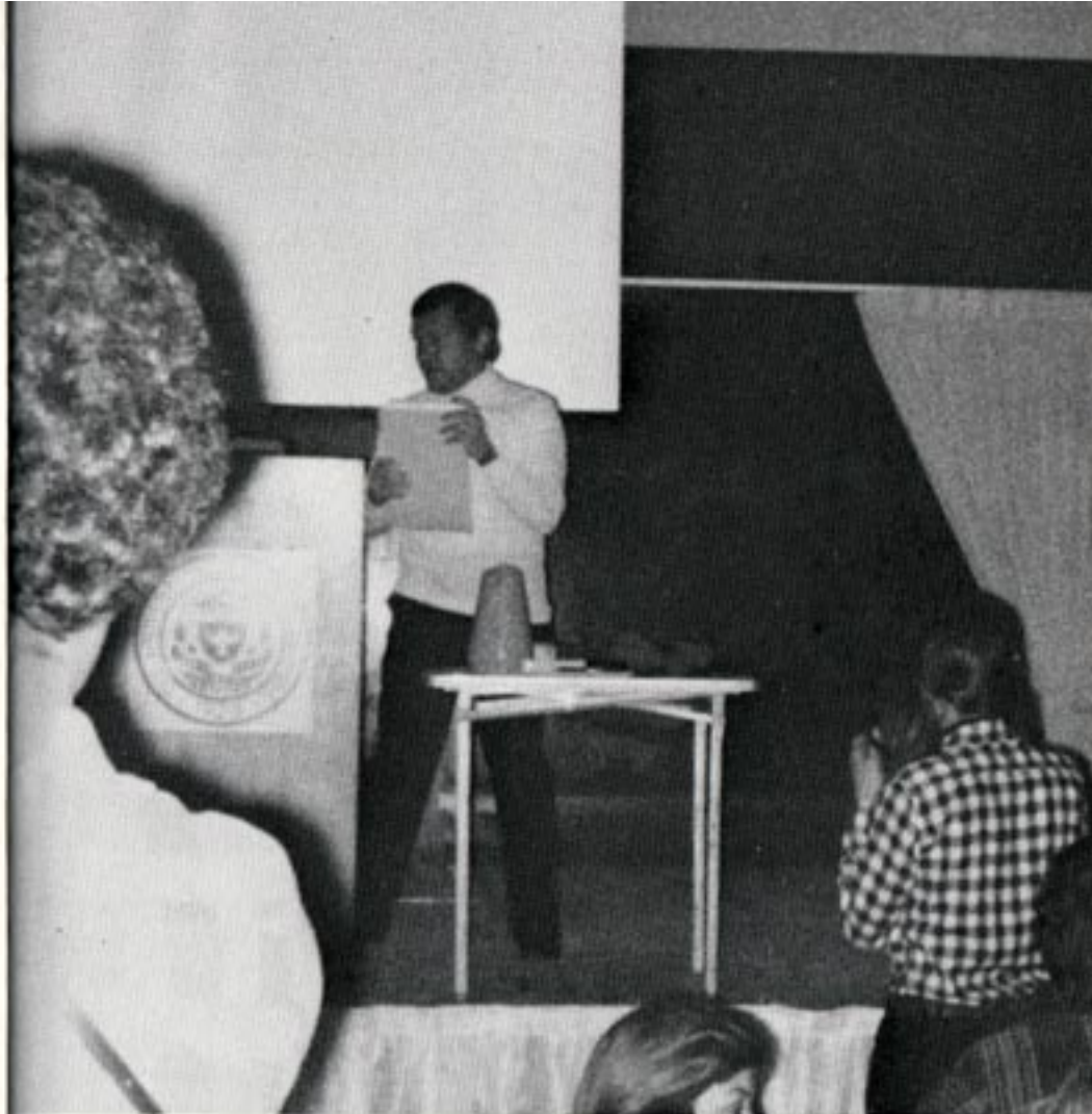
After the lecture was a lively question and answer session.